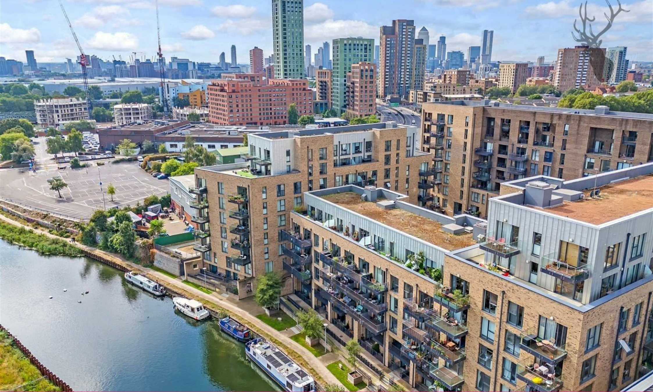
Nicholson Square, London, E3